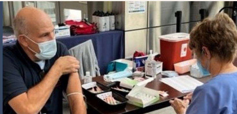
Vaccine Clinic: Penn State University-Harrisburg (Dauphin County)

The South-Central PA Medical Reserve Corps thanks its many volunteers who continue to support the nine-county region with a population of 2.4 million people. You are truly lifesavers!