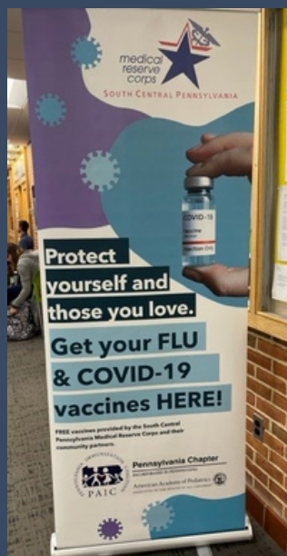
50+ Vaccine Clinic (Lebanon County)