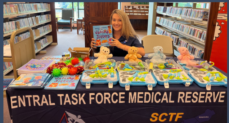
Vaccine Education: Fredericksen Library (Cumberland County)