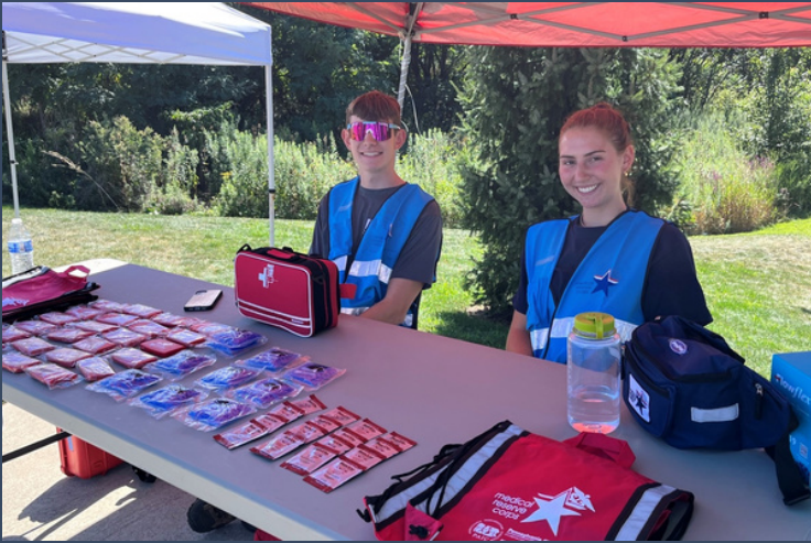
First Aid Tent: Canned Jam Music Festival (Dauphin County)