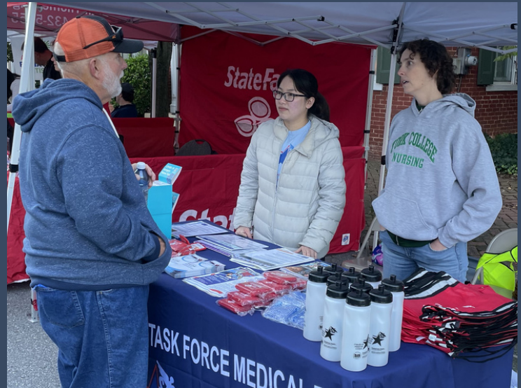
Vaccine Education: Dillsburg Farmers Fair (York County)