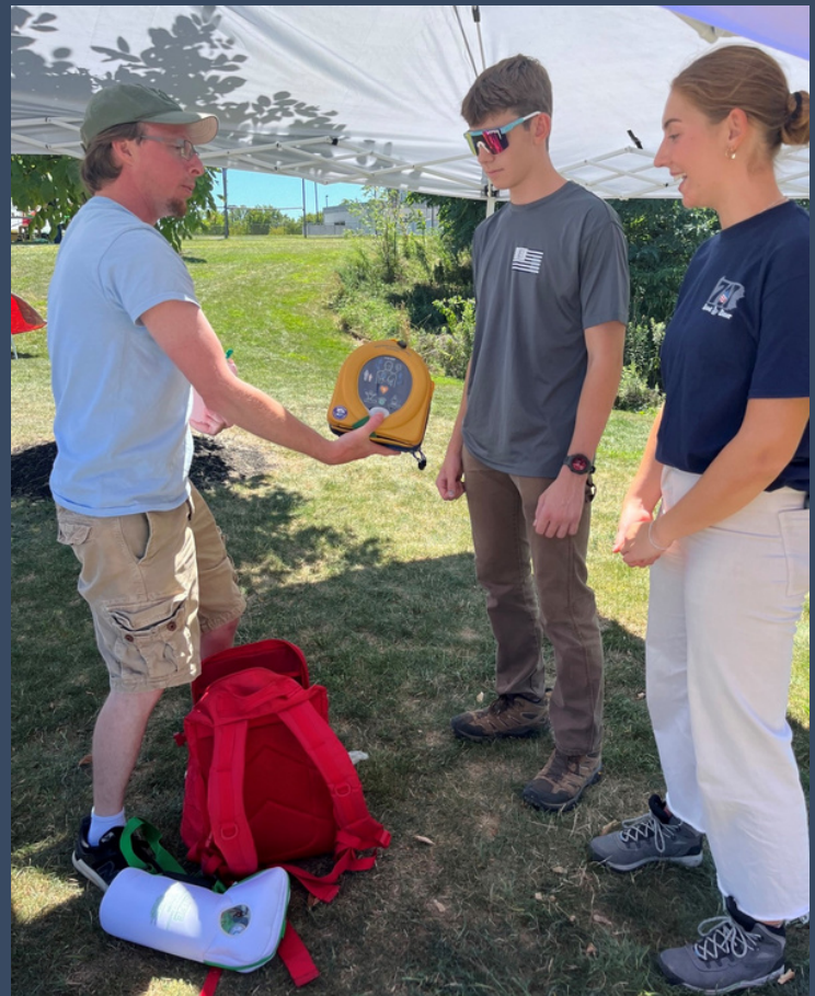
Environmental Health Event at the Dauphin County Canned Jam Music Festival