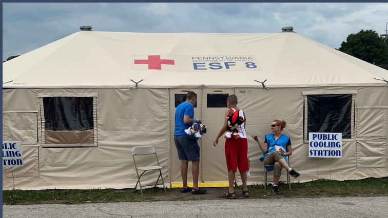
Cooling Tent: York County Fair