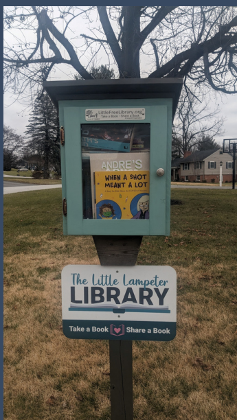
Vaccine Education (Lancaster County)